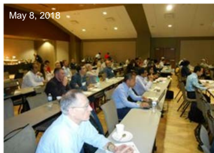
Sixth Smart Grid Workshop, College Station, TX.

More than 140 attended including 55 students, 14 postdocs and research staff, 48 faculty members, and 15 representatives from industry (ABB, CNP, EPG, ComEd, Esri, GE, Landis+Gyr), government entities (NREL, PNNL), and non-profit organizations (EPRI, ERCOT). NSF Travel grant was awarded to 38 participants.