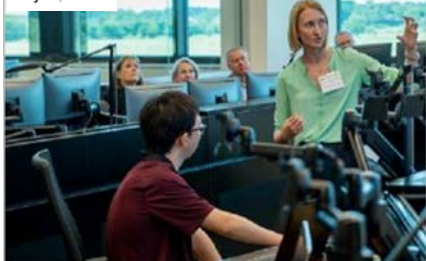
Demonstration for Advisory Board members and guests at the Smart Grids Control Center.